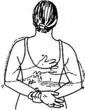
Assisted Internal Rotation