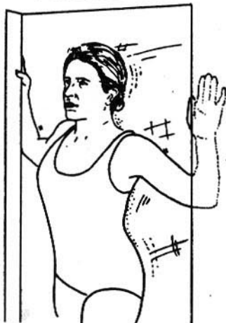
Abduction, External Rotation